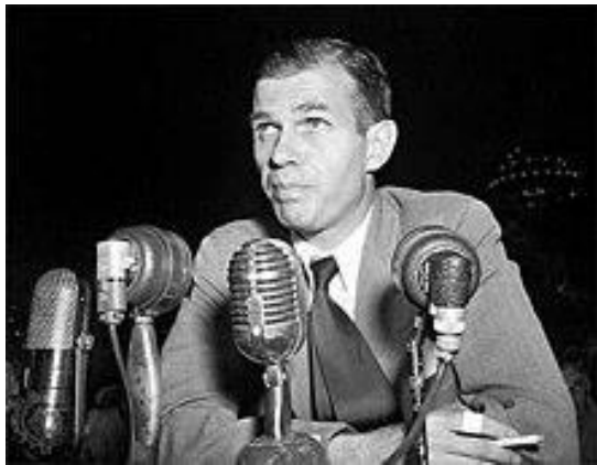
Alger Hiss testifying in 1948 after being accused of spying for the Soviet Union in the 1930s

These espionage activities, believed to be directed by the Kremlin, aim to steal military, economic, and political secrets. With the FBI ramping up its counterintelligence efforts, there is a pressing national dialogue about the adequacy of current measures to safeguard American secrets and the need for more rigorous security protocols. This discourse is set against the backdrop of international tension, where the U.S. faces not only traditional state adversaries but also ideological battles that penetrate domestic borders.